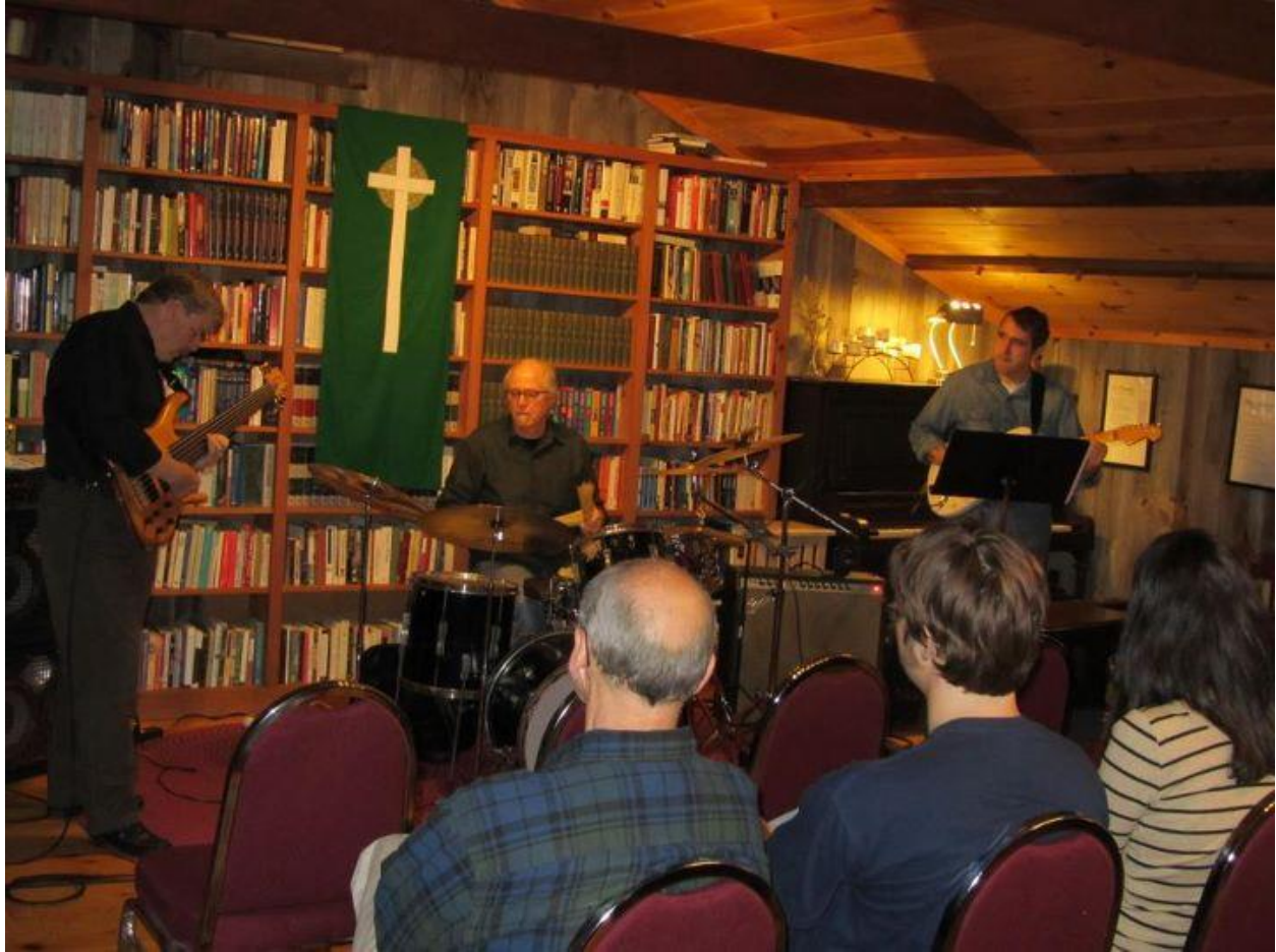
1FlightUP, Peltier House Concert, in Amherst.

In 2012, we look forward to telling/living Chapter 2 of imagine/Northampton's Kingdom vision of: Building Kingdom-focused communities which creatively engage the culture to help people discover and follow the God who is far more than they imagine.