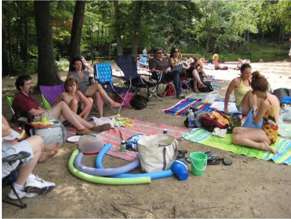
Relaxing at Puffer's Pond in Amherst This Summer.